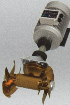
AC electric up to 175 ft · 53 m