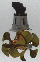
Hydraulic up to 175 ft · 53 m