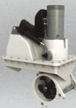
DC retract up to 100 ft · 30 m